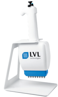
8-channel semi-automatic capper