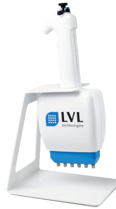
6-channel semi-automatic capper