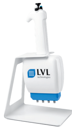
4-channel semi-automatic capper

SBS 96: RCK-CR96-P-L SBS 48: RCK-CR48-P-L SBS 24: RCK-CR24-P-L